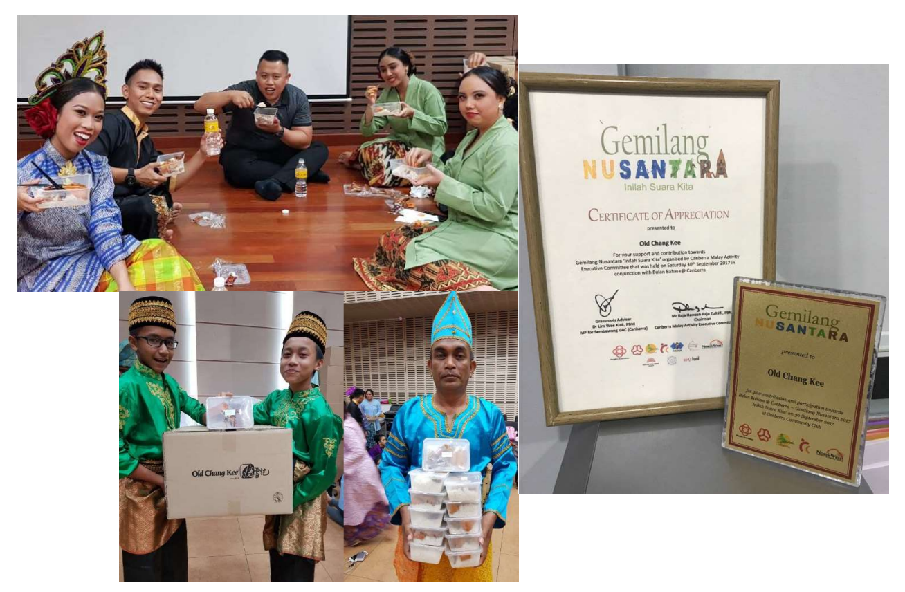
Date: 30 September 2017 Event: Food Sponsorship for Canberra CC Mid Autumn Festival Event 2017