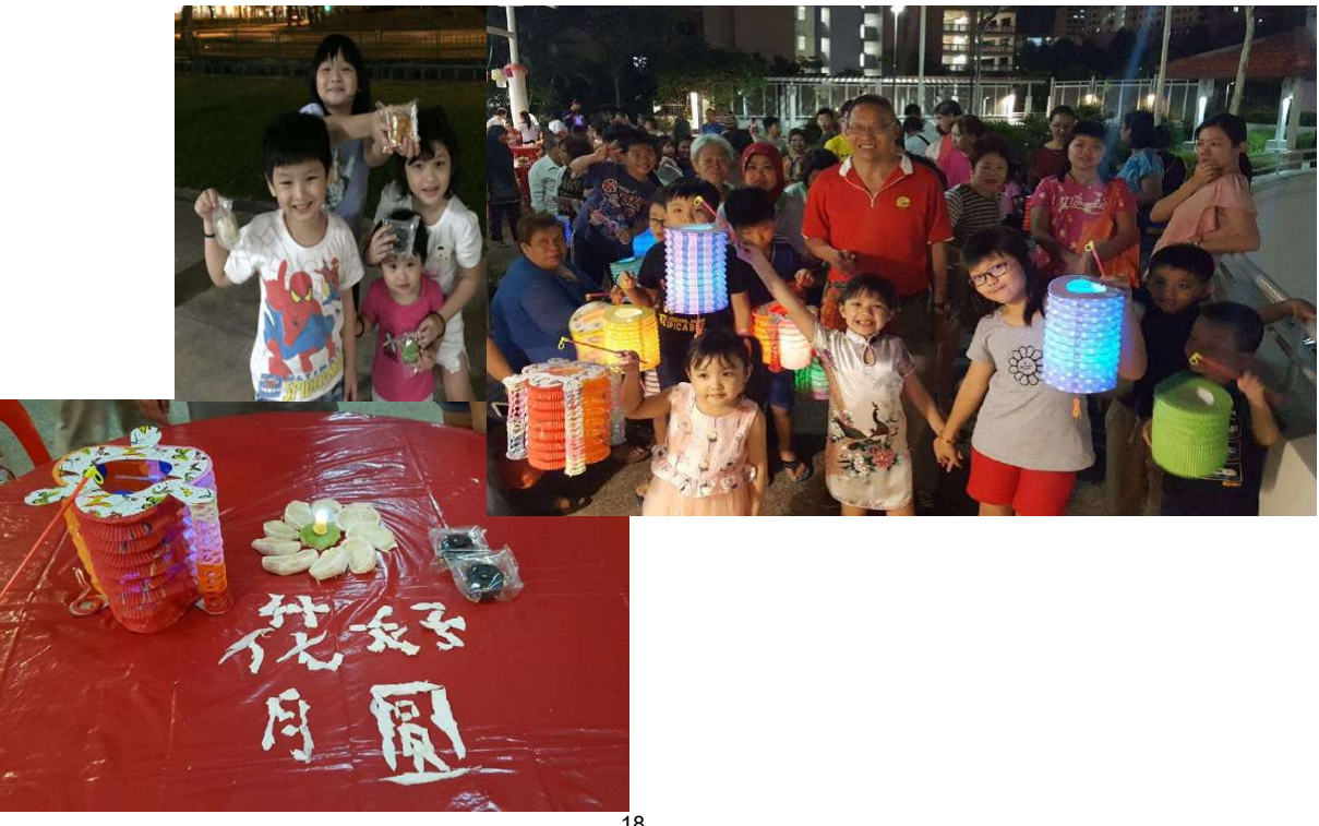
18 Old Chang Kee Ltd. Sustainability Report 2018